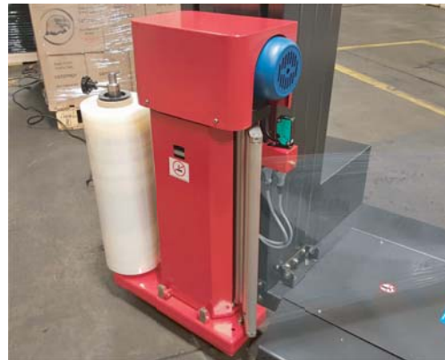
Film Carriage Assembly